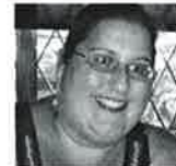
A Note from the Choir Director

I can't believe September is here, the summer has flown by. I want to say thank you to all of the people who provided special music this summer. Our church is truly blessed with musical talents and I appreciate the fact that so many of you are willing to share those talents with us.