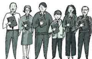
NATIONAL BIBLE WEEK

In honor of National Bible Week and in observance of the 400th anniversary of the King James Bible there will be a special exhibition of church owned bibles through the centuries. Included will be our Goeb Bible (one of only 70 known) which had belonged to the Altfather family. It is a version of Luther's German Bible still in use in many areas of Germany today. We also have many antique King James versions as well as other scripture. The exhibit will be up the entire week from the day of our annual meeting, November 20th, through November 27th when we host our annual Advent dinner. This exhibit is only the first of many being prepared by our History Committee in preparation for our anniversary year (2012) when we will be 235.