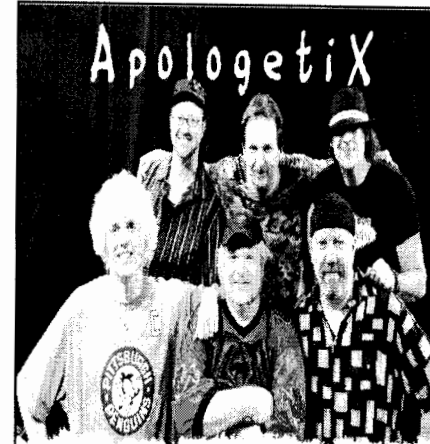
That Christian Parody Band